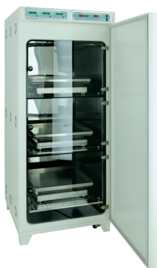
Outer door Open