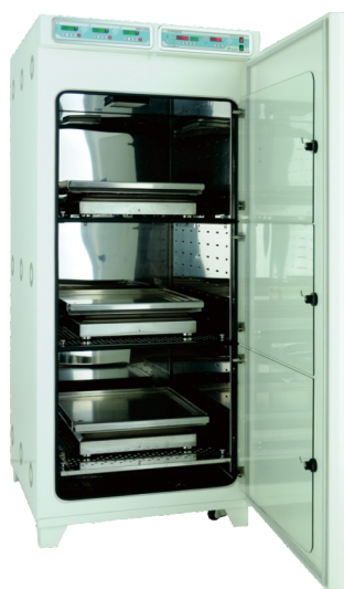
Inner doors Open